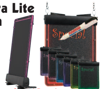
Special Price $73.95

Can be displayed hanging (chain included) or standing for use on counter top or other surfaces.