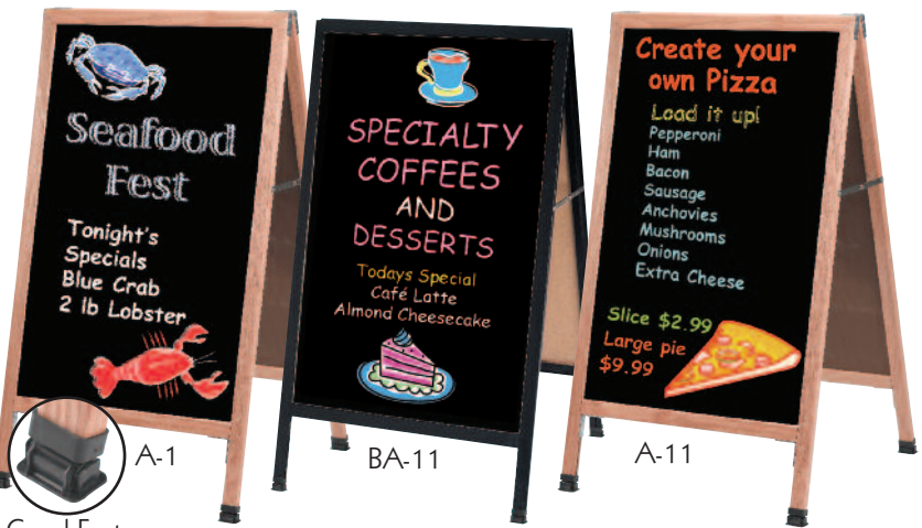
Camel Foot Leveler