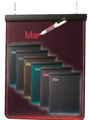
Special Price $149.95