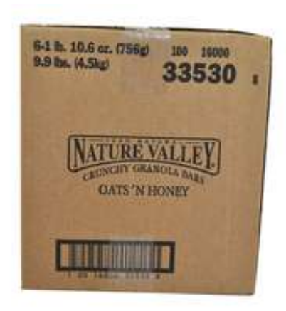
Case / box short side 2