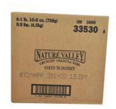
Case / box wide front side 1