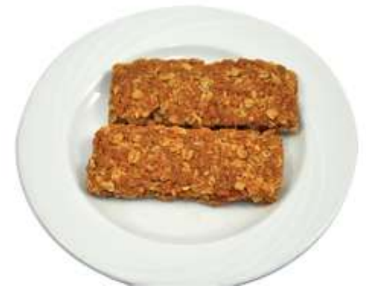
Front of product