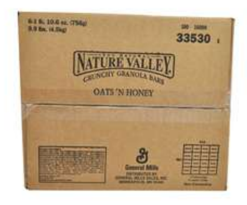
Case / box top