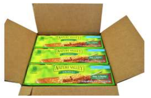
Case / box inside view