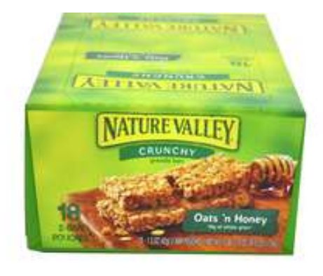
Inner pack back side