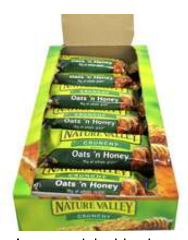
Inner pack inside view