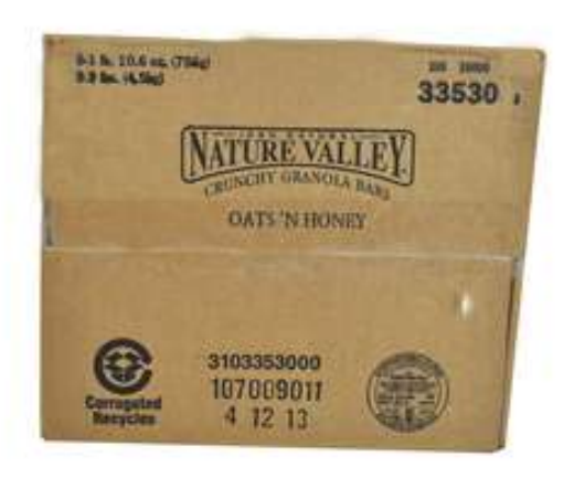
Case / box bottom