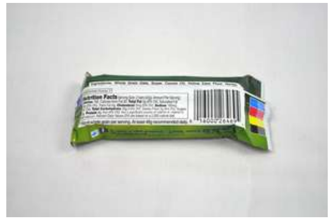
Inner pack back side