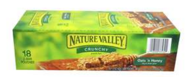
Inner pack side 2