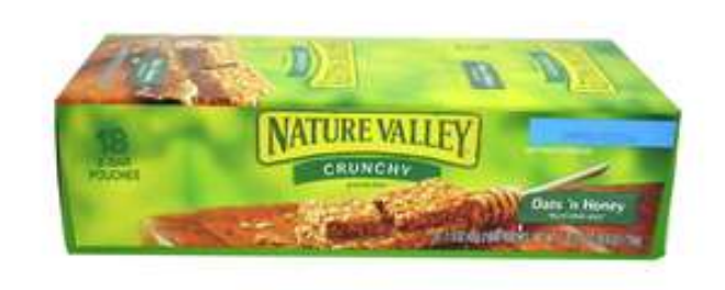
Inner pack side 1