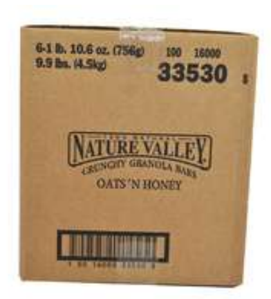
Case / box short side 1