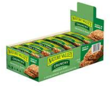
Inner pack front side