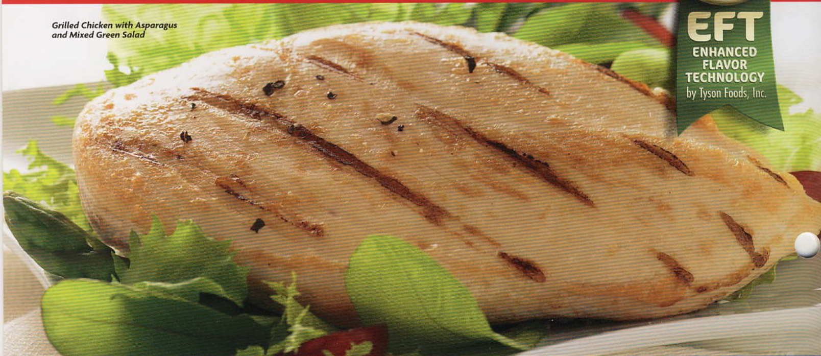
Grilled Chicken with Asparagus and Mixed Green Salad