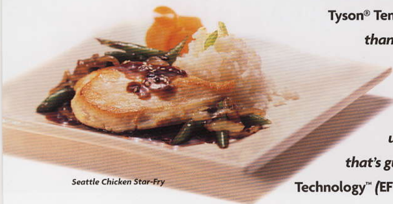
Seattle Chicken Star-Fry

Tyson® Tenderpressed® breast filets cook faster and more evenly than commodity breast filets. They stay tender and flavorful longer in cook-to-hold situations. And they eliminate the thawing, trimming, and pounding you'd have to do to produce comparable dishes using commodity filets. They flat-out perform for you; and that's guaranteed. And through our proprietary Enhanced Flavor Technology™ (EFT™) process, they're now 100% All Natural™.