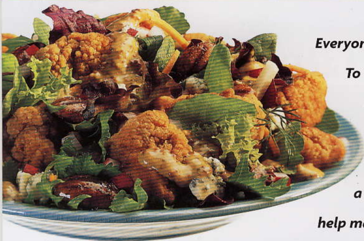
Buffalo Chicken Salad

Everyone loves crispy, crunchy, totally dippable chicken.