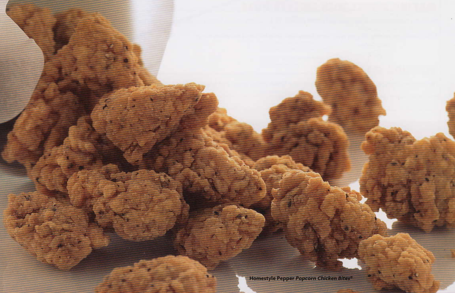
Homestyle Pepper Popcorn Chicken Bites®