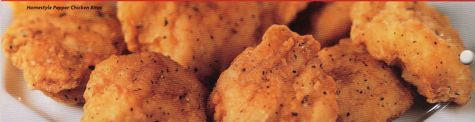
Homestyle Pepper Chicken Bites

Tyson Chicken Bites —More consistently sized for better portion control, Tyson chicken bites also feature flavor in every bite. The bold flavors carry all the way through, from the light and flaky breading to the juicy pieces of breast meat.