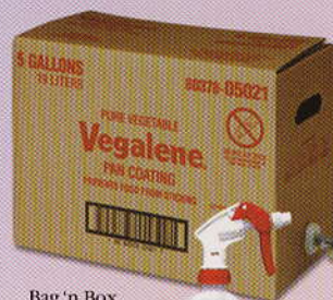
Bag 'n Box