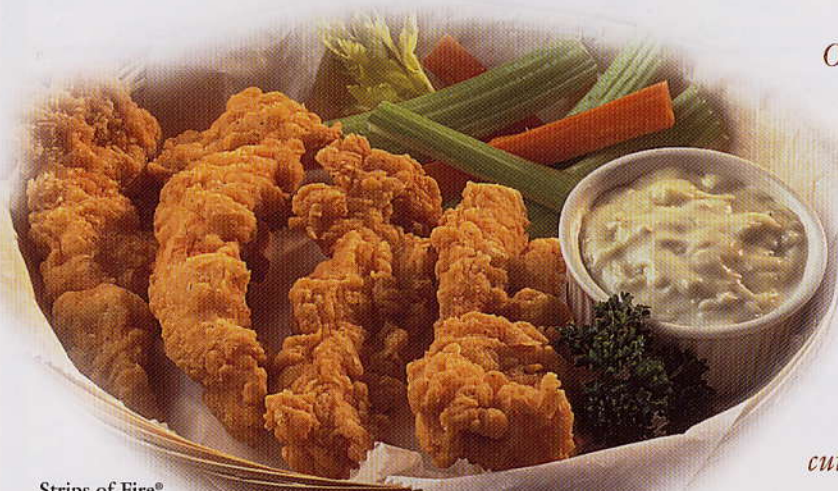
Strips of Fire® Chicken Basket

Orders of chicken strips, bites, and tenders increased almost 16% when served as appetizers instead of main dishes. And to help you capitalize on these popular products, Tyson Foods, Inc. will help you evaluate the options in the most extensive product line available. Whether you need a fully cooked variety to minimize time and labor—or a particular flavor, breading, or meat cut—Tyson Foods can help make your next chicken strip, bite, or tender a success story too.