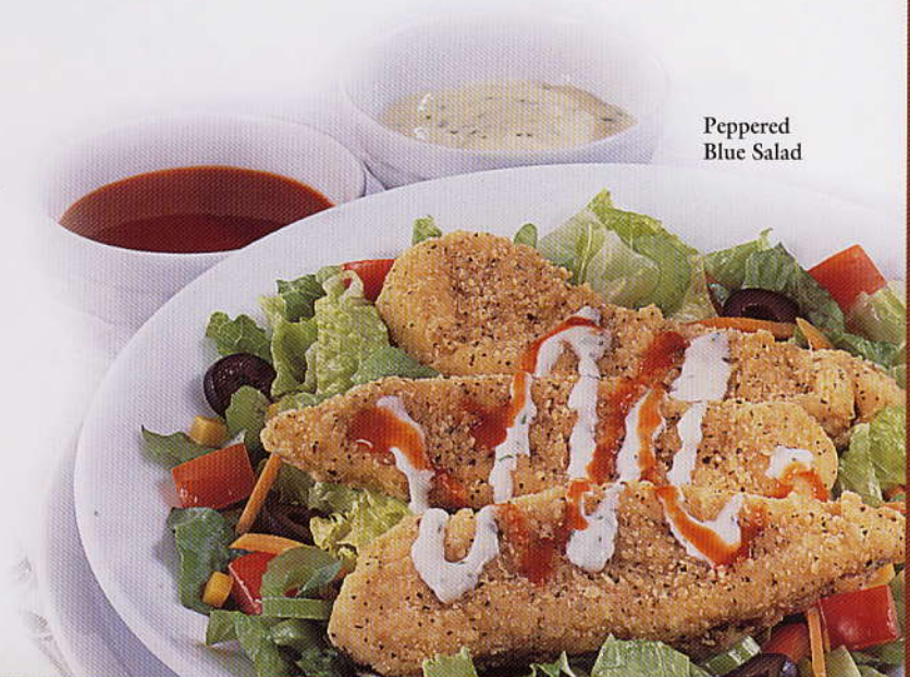
Peppered Blue Salad