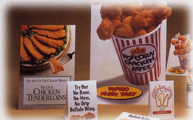
Table Tent —Die-cut three-sided 5" x 6" table tent. TFS-97-1612

Waitstaff Sticker —2½" adhesive-backed sticker. TFS-97-1624