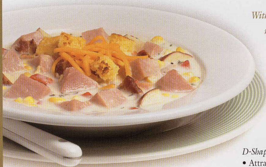
Knife 'n' Fork Corn Chowder

With Tyson Hams, you're sure to find just the one you need for any application. Our extensive product offering covers everything: Pit Hams, Carving Hams, Slicing Hams, and Shaving Hams. And you can count on Tyson Hams for quality, consistency, and great taste every time. So hot or cold, entrée or sandwich, Tyson Foods, Inc. has you covered.