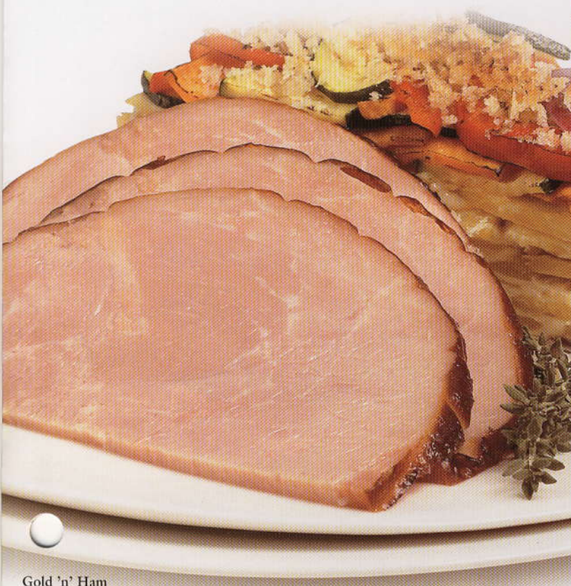
Gold 'n' Ham

Sliced smoked honey ham, fresh spinach, Parmesan cheese, tomato, and bacon vinaigrette served on fresh-baked bread.