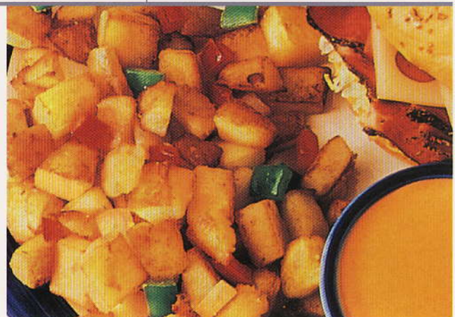
Simplot Classic FREEZERFRIGE Cubes

The Simplot Food Group 6360 South Federal Way Boise, Idaho 83716