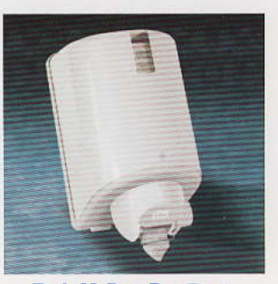
Tork M-Box Pro WT Watertight centerpull dispensing system