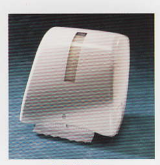
Tork Matic II Mechanical hands-free dispensing system