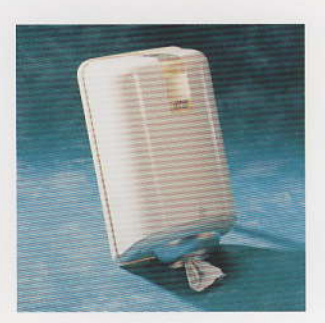
Mini-Tork Compact centerfeed system