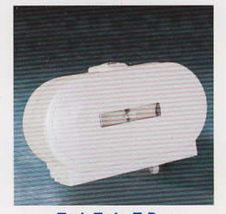
Tork Twin T-Box Never empty jumbo bath tissue system