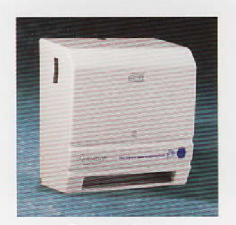
Tork Intuition Electronic, no touch roll towel system