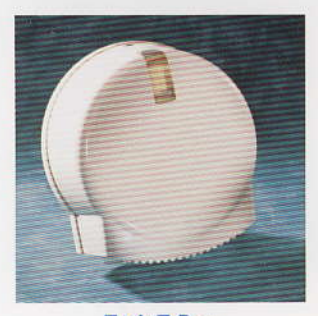
Tork T-Box Jumbo bath tissue system