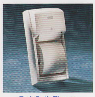
Tork Bath Tissue High capacity conventional bath tissue system