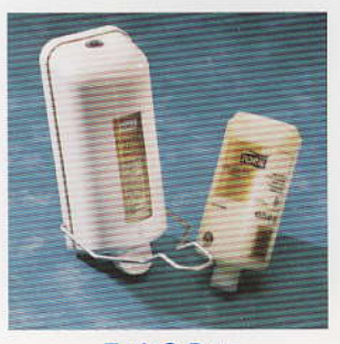
Tork S-Box Portion controlled soap dispensing system