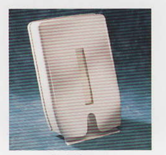
Tork Xpress Upscale interfolded towel system