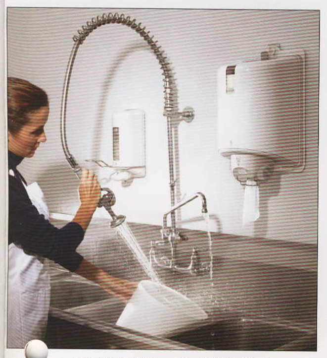
The Tork M-Box Pro WT is ideal for wet or humid work environments.

SCA's new watertight "Tork M-Box Pro WT" is a high capacity towel dispenser that is perfect for wet or humid environments.