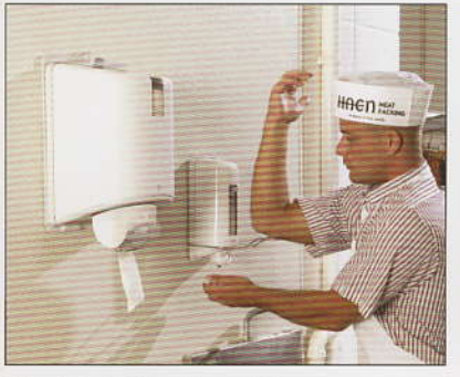
The Tork family of dispensers offers hands-free dispensing options for improved hygiene.