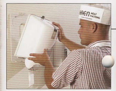
The optional* mounting bracket allows the Tork M-Box Pro WT to be easily removed for cleaning.