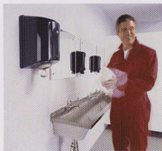
Ideal for Tough Environments