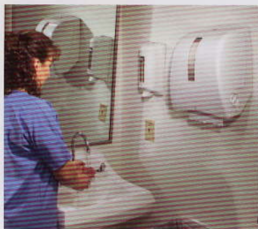
Tork Matic is an ideal solution for virtually any high-traffic restroom or wash station.