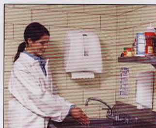
Tork Matic WT