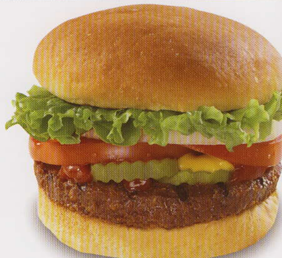
Morningstar Farms® Grillers Prime® Veggie Burger