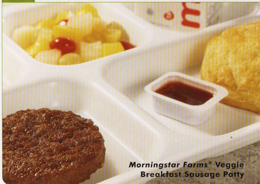
Morningstar Farms® Veggie Breakfast Sausage Patty